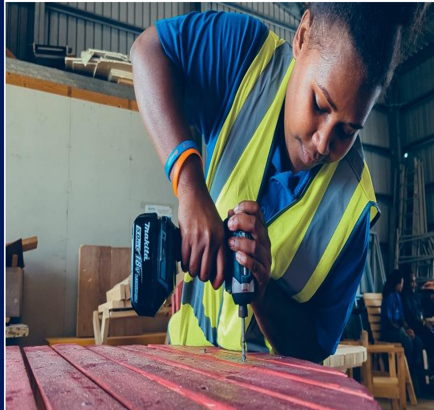
Green Construction Training Program (GCTP)