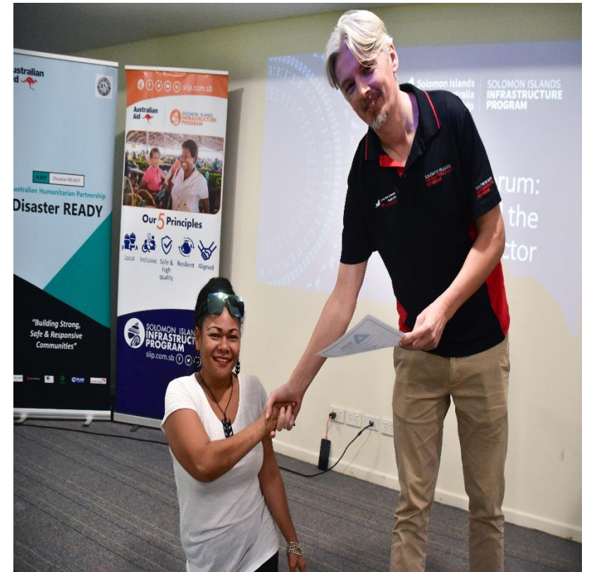
EmployAble: Improving Employment Opportunities for People with Disabilities