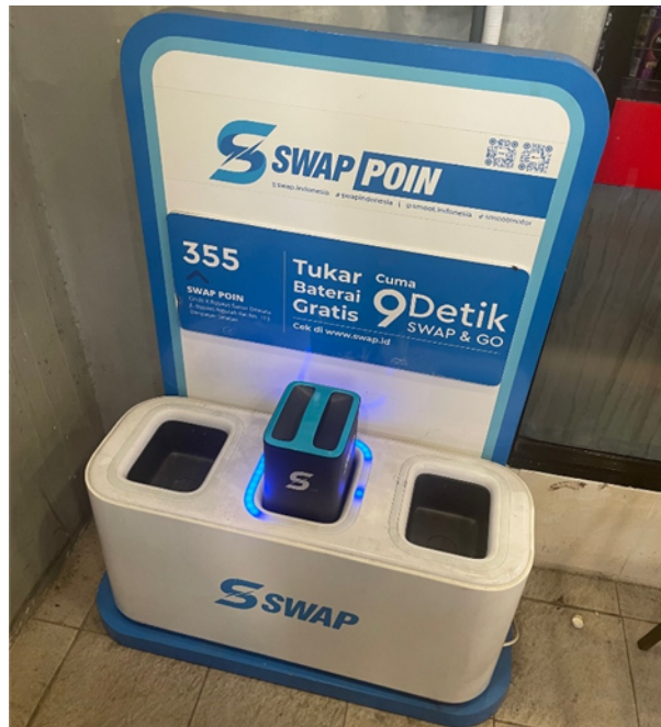
Figure B. 6: Example of a Battery Swap Station at a Convenience Store