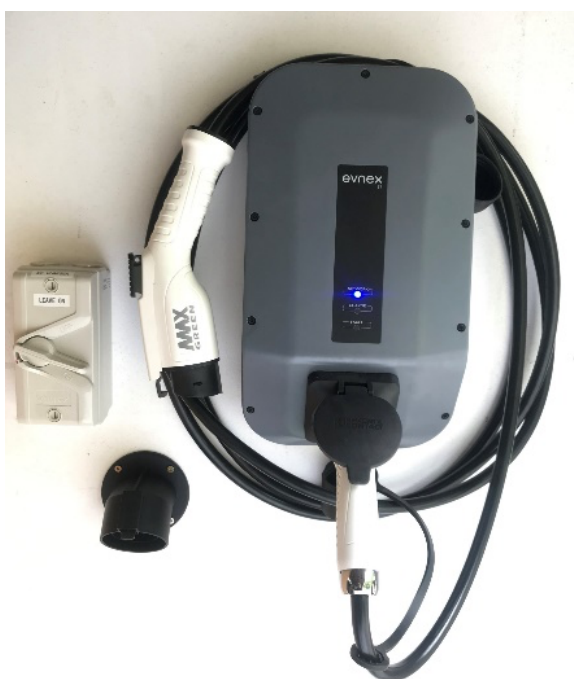
Figure B. 4: Example of a Typical Mode 3 Charging Point

Where the electrical supply's safety protection system is hard-wired to the dwelling's local electricity supply circuit and connects via a charging cable to the vehicle's on-board AC-to-DC charger (with the onboard charger then delivering a DC supply to charge the battery, see Figure B. 4). This is referred to as Mode 3 charging. The safety features of the Mode 2 "brick" are present but are hard-wired, and the arrangement and specification of safety components provides added safety – which is why Mode 3 charging is encouraged for the slower charging of EVs over the use of (Mode 2) portable devices. As for other hard-wired domestic appliances (such as an electric oven), a wall charger must be installed by an accredited electrician, who is required to ensure all safety requirements are met, including that the supply circuit is appropriate for the expected current draw (whereas while the supply circuits to the socket outlets used for Mode 1 and Mode 2 charging should be checked, it is less certain that these checks will happen in practice). Ideally, Mode 3 chargers would also be "smart" – where the charging rate and time of charging can be managed remotely. This is discussed further below. Mode 3 charging can be either single- or multi-phase, with multi-phase enabling higher charge rates if the supply circuits (and Mode 3 charging point) are suitably rated.