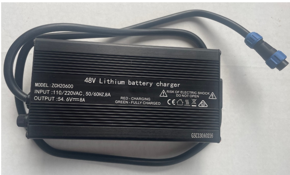
Figure B. 2: Example of a Generic Power Supply/Charger