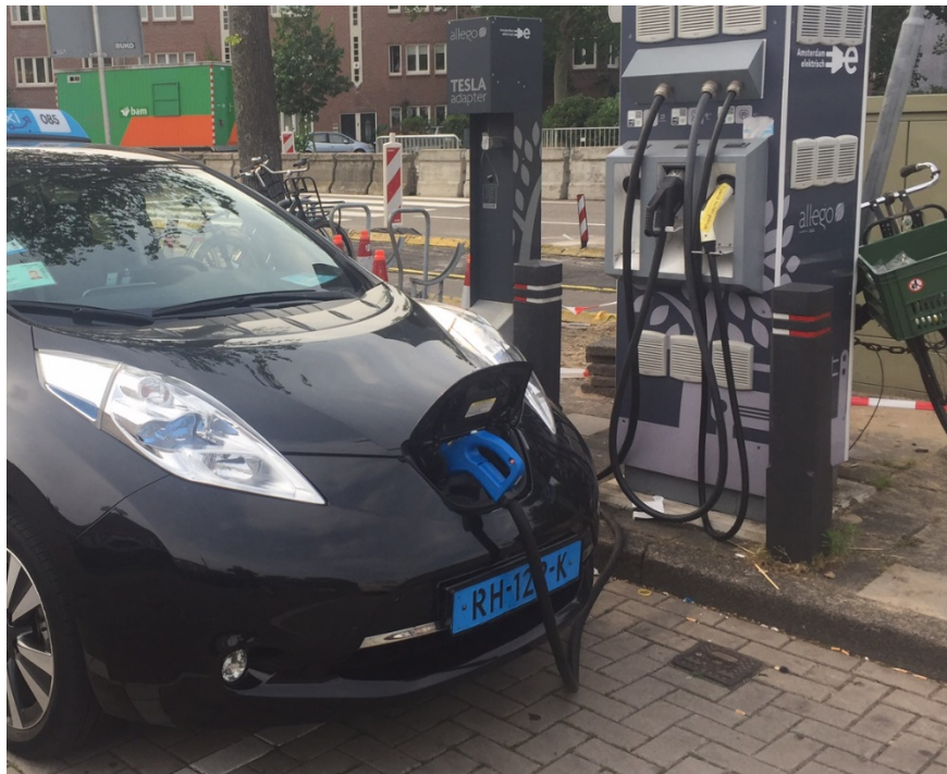
Figure B. 5: Example of a Typical Mode 4 Charger with Choices of Different Connectors