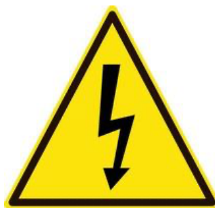
Figure C. 1: High Voltage Symbol

Figure C.1 provides a symbol that must be used to indicate the nearby presence of a high voltage source. This symbol should be visibly displayed on or near the EESS or on enclosures that are reasonably accessible to those operating the vehicle or providing service support to it, and where the enclosure protection barrier can be removed without the use of tools, potentially exposing live components of the high voltage system.