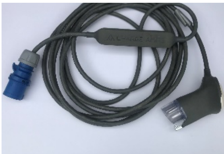
Figure B. 3: Example of a Typical IC-CPD Charging Cable

Note that there is a risk that IC-CPDs supplied with imported used vehicles are not specified for use with the electricity supply in some PICs, and ideally these non-compatible IC-CPD charging cables would not be allowed to enter the country. 103 Similarly, a check is required to ensure that the IC-CPD does not draw a greater current than can be safely delivered by the socket outlets that they might use. 104 Furthermore, the earth return on a three-wire electricity supply provides an important safety function and an IC-CPD charging cable should only be used with a three-pin supply plug on circuits that have a sound earth circuit.